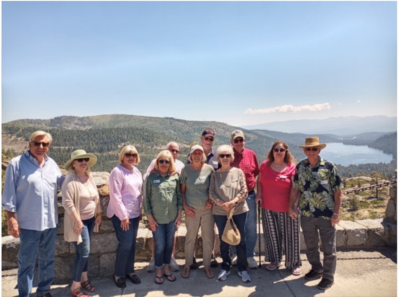
Above: Our group, posed at the overlook of Donner Lake Below: Driving picture, on the drive in the High Sierra